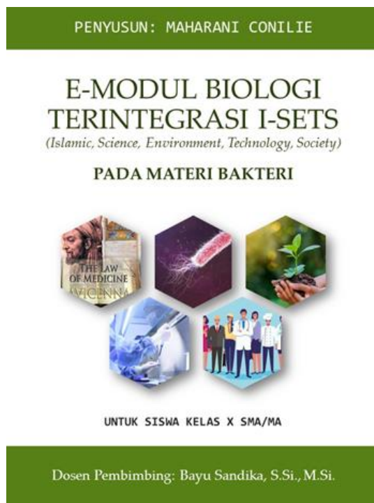
Figure 1. Biology E-Module Cover Design